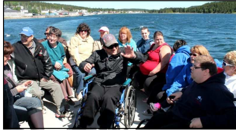
Community Readiness participants take a boat tour from Bide Arm.

over the past year. More than 40 events were held, including Caregiver Appreciation Day, Earth Day, Family and Friends Christmas Brunch, Mental Health Retreat for Caregivers, and Music and Friends Social and Friendship Day in Bird Cove. The funds also allowed