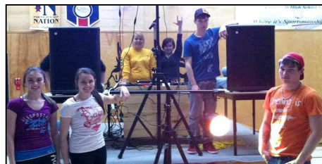
St. Lewis Academy students proudly display new sound and lighting equipment.

We were ecstatic when word was received that the IGA was granting $5,500 for