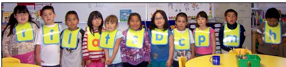
Grade 1 students at Nain display words in Inuttit through a new oral language project.