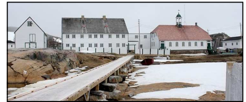
The Moravian Complex at Hopedale

In order for the site to generate a steady stream of revenue throughout the entire year, greater exposure is required to make the complex a go-to destination. Projects like the restoration of the boardwalk – made possible by a $12,000 grant from the International Grenfell Association – appeals to the community and tourists. The complex needs exposure to illustrate what it has to offer and that involves new projects that require web access, signage